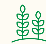
Parks With Landscaped Gardens