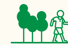
Jogging Tracks And Footpaths