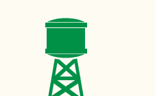
Overhead Tank With Adequate Capacity