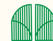
Impressive Entrance Arch