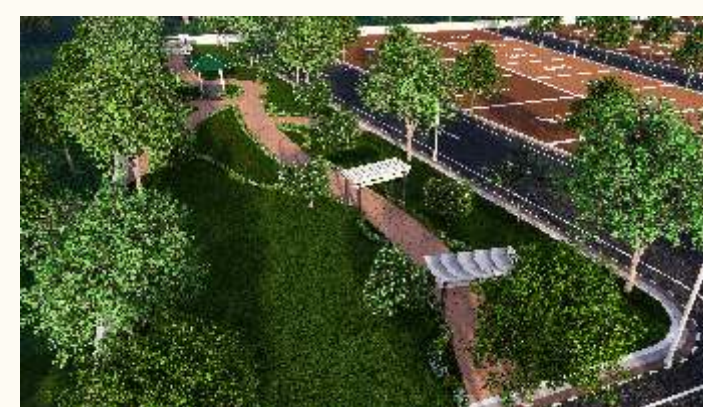
Jogging Tracks & Footpaths