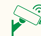
Round The Clock Security With Compound Wall